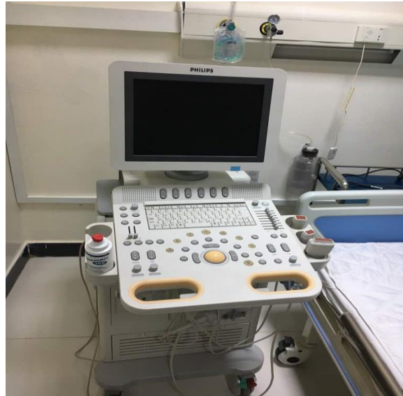
(E) Faculty of Radiography and Medical Imaging Sciences