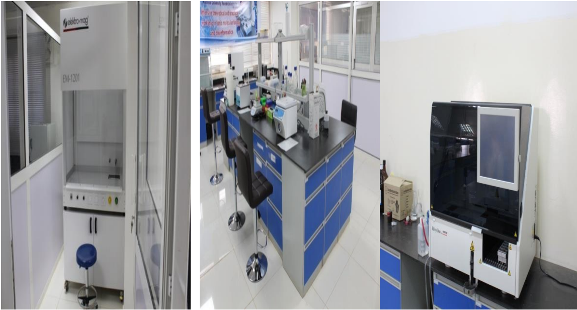
(B) Faculty of Medical Laboratory Sciences